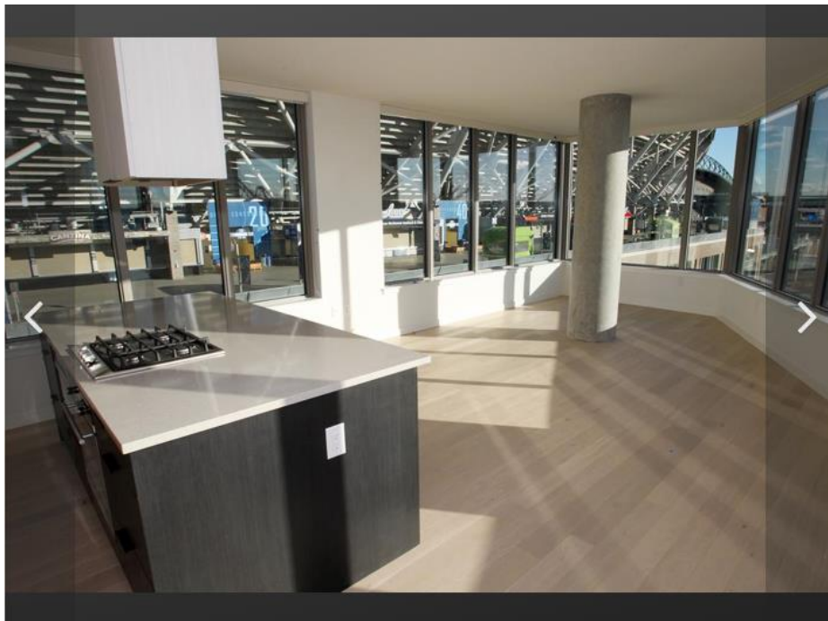
The unique shape of the Gridiron condo building means that no two units have the same floor plan. This is an 11th floor home at the south end of the building.

Parking is not included but can be bought for $50,000 a stall. Musselwhite said that a number of homebuyers that could have bought parking did not because Gridiron is within walking distance of light rail and bus service at the International District/Chinatown transit station and commuter rail and Amtrak service at King Street Station.